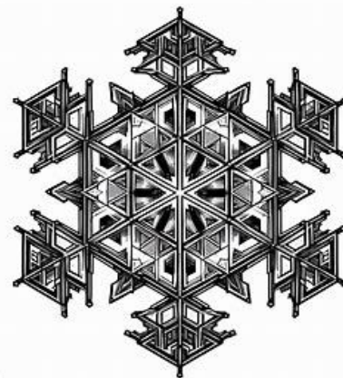
All snowflakes have six sides.

All snowflakes have six sides. Why six sides? Well, it's all about the way water molecules connect when they freeze. They link up in a hexagonal pattern. The shapes they create are beautiful.